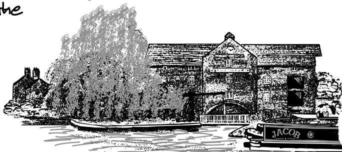
The Clock Warehouse, Shardlow

Unfortunately the lockkeepers Rest micropub is now closed.