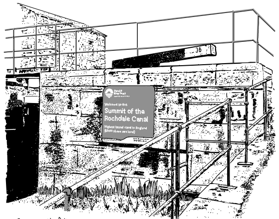
The summit of the Rochdale Canal

As of Autumn 2024 the towpath is closed for half a mile heading up out of Hebden Bridge, and you will need to take the parallel Halifax Road, A646, until you rejoin at Chardestown.