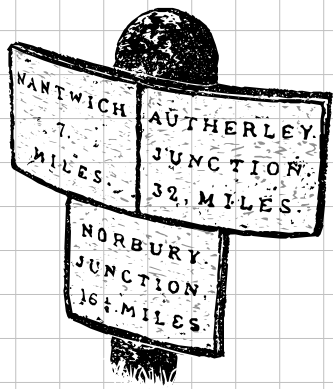
Milepost at Audlem locks Shropshire Union Canal

Continue along a fairly boring final few miles to Nantwich Aqueduct, where the B5341, Welsh Row (a historic street), passes underneath. Cross the aqueduct, continue past the steps, and take the