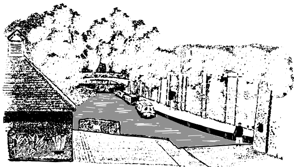
Waiting to pass: Harecastle Tunnel North Entrance Trent & Mersey Canal

Continue on the towpath which is on the left-hand side. Shortly the Macclesfield Canal goes off to your left (it crosses the Trent and Mersey 500m further on to head east). At lock 41, by the junction, cross the road bridge and down the