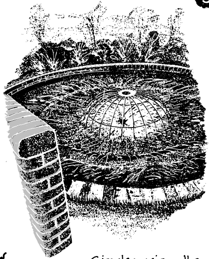
Circular weir on the Staffs & Worcester

The unusual Bratch Locks are worth a stop, and an explanation of how they operate from volunteers, if available (they use side ponds and culverts - very exciting!).