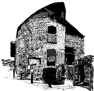
Bonded Warehouse, Stourbridge

At the foot of the locks at Wadesley Junction cross the footbridge onto the Stourbridge Town Arm. It is approximately 1 mile to the basin in the town centre, which features an unusual bonded warehouse. Return to the junction and turn left over the footbridge.