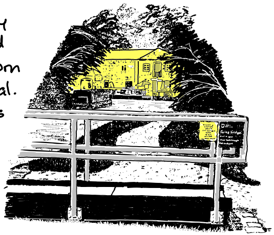
Approaching Fradley Junction

Continue to the popular Fradley Junction, where pubs, cafes and gongoozlers may delay you. Turn right onto the Trent + Mersey Canal. The towpath is very good at this point as it is a popular tourist destination, and also forms an access road for the initial stretch.