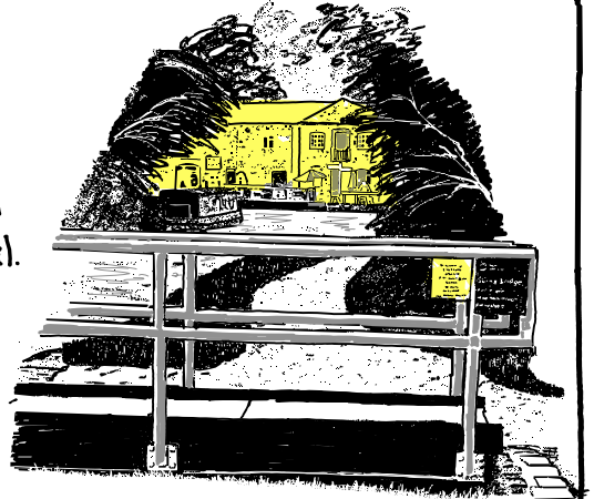
Approaching Fradley Junction

Continue to the popular Fradley Junction, where pubs, cafés and gongoozlers may delay you. Turn right onto the Trent & Mersey Canal. The towpath is very good at this point as it is a popular tourist destination, and also forms an access road for the initial stretch.