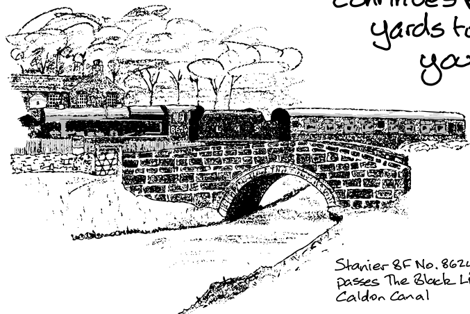
Stanier 8F No. 8624 passes The Black Lion, Caldon Canal

It's a couple more miles to Froghall Tunnel, by which time the canal is very narrow. Go up the slope to the road, and the path continues immediately opposite. At the far end of the 75 yard tunnel the towpath continues for a further 400 yards to the wharf, where you will find the busy Hetty's Tea Shop.